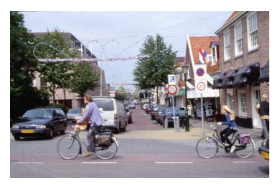
One third of all trips in Holland are taken by bicycle.